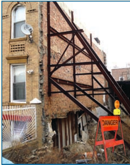
Supporting exterior wall, do to shifting, settlement and missing foundation.

To paraphrase sections of the New York City Building Code on "Protection of Adjacent Structures and Property During Construction or Alterations"