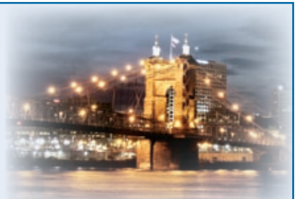
Cincinnati Roebling Suspension Bridge

Did You Know...? The Brooklyn Bridge is the only place on earth that an airplane could fly over a pedestrian who was walking over a car that was driving over a boat that was sailing over a train. (The subway runs under the East River)