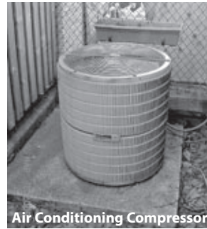
Air Conditioning Compressor

On the average, a homeowner who upgrades a residence from window box air conditioners to central air increases their property value by as much as 10%. That alone could encourage one to "go central," but now there's even more of an incentive. On January 23, 2006, the Department of Energy issued new manufacturing standards that will improve the energy efficiency of several common household appliances, including central air systems.